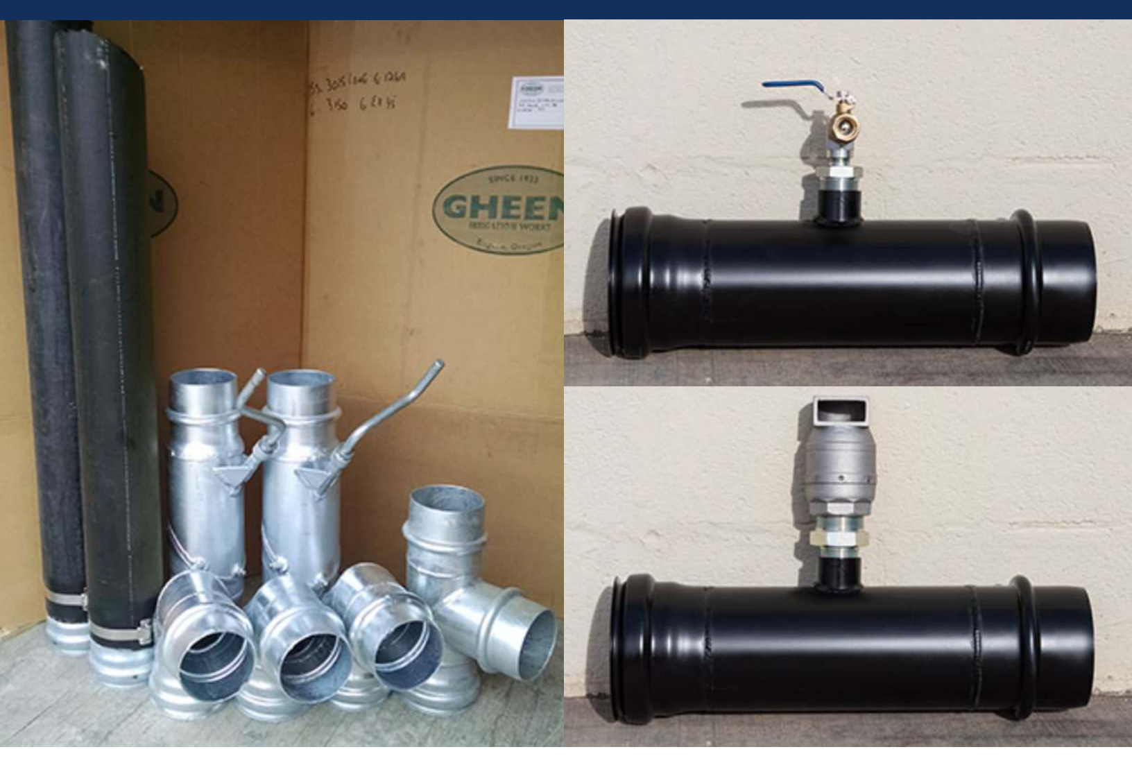
Left: Manifold Kit. Top Right: Inspection Port. Right: Vent Check.

We offer a variety of discharge pipeline compents. Our Manifold Kit allows you to pump into two GeoTubes, each additional GeoTube requires more discharge compontents.