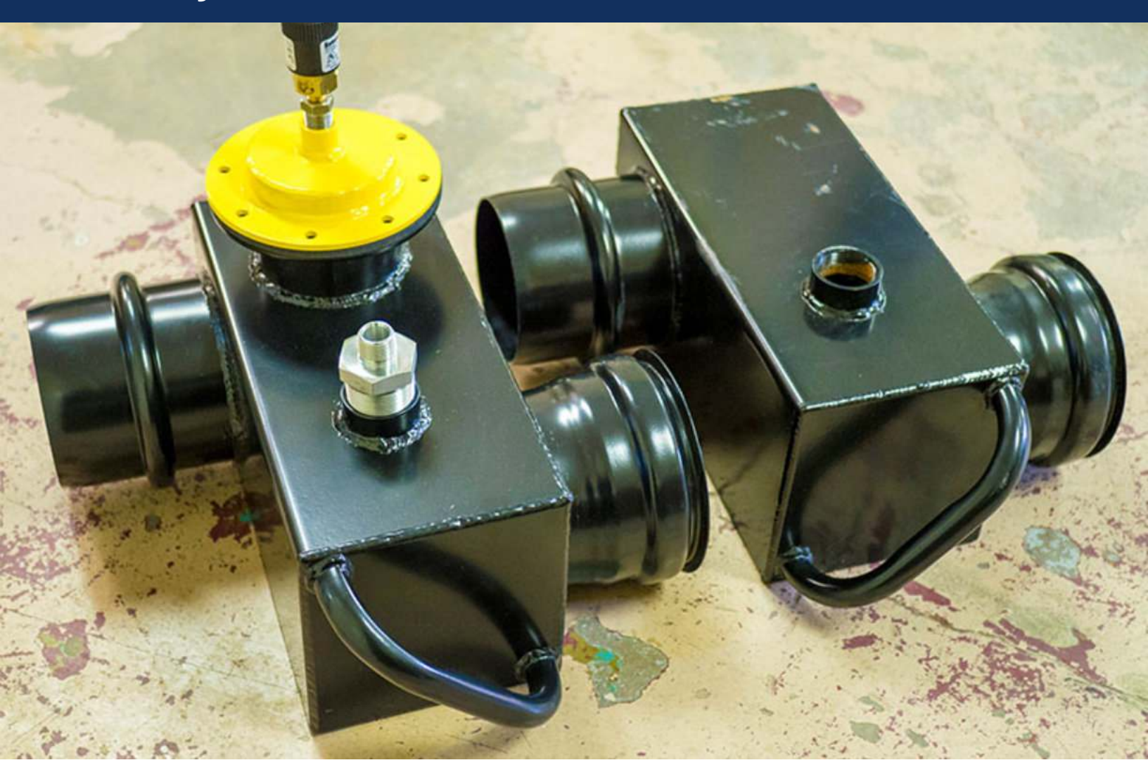
Left: Mixer box w/ PSIC Right: Mixer Box.

Polymer mixing boxes offer a point of injection for polymers mid discharge. We also offer an Automatic Pressure Sensing Injector Controller (PSIC).